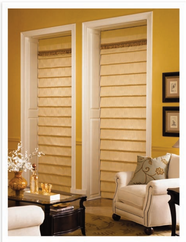
Springs Window Fashions – Bali® Custom Tailored Roman Shades in Flax

White is now a business color as technology has produced amazing new and practical finishes, which helps explain why white is showing up everywhere, even in corporate board rooms. The contrasts are all in the finishes: matte versus gloss; shine and shimmer on reflective surfaces; textured whites versus smooth, all washable and cleanable. White also represents purity of thought, motive and result, exactly what we want from businesses now.